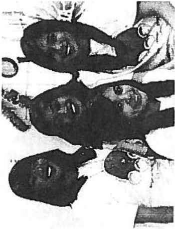
MeneMAC "video jockeys" host MegaConference Junior 2009